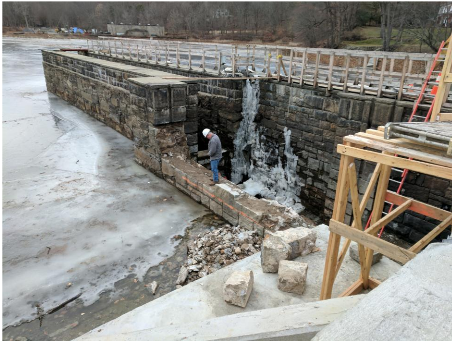
Primary spillway after stone/masonry removals to approximately elev. 487.5 ft. Temporary stone/masonry crest will be raised to elevation 492 ft. with the construction of a new reinforced concrete weir structure.