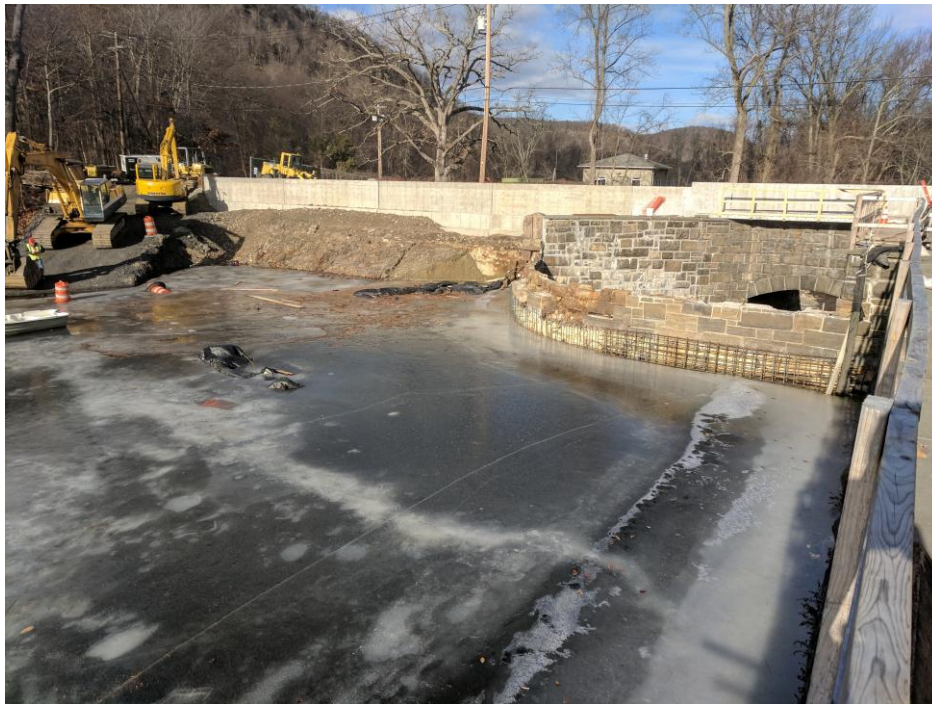
Completed reinforced concrete parapet wall with exception of Segment A on far left side. Photo also shows high construction water condition in front of Auxiliary spillway.