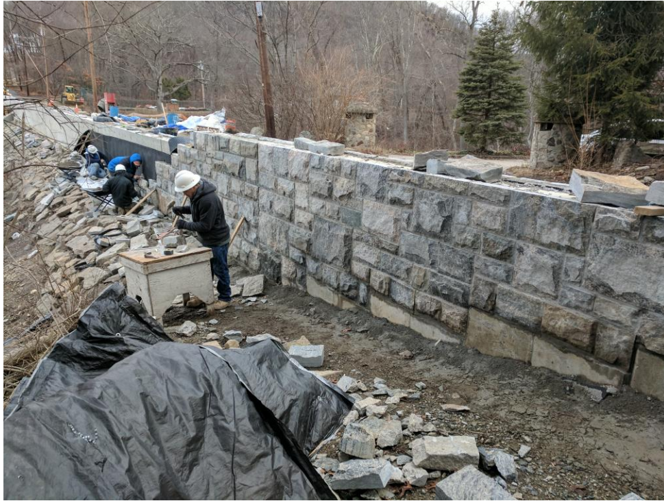
Parapet wall stone effacement construction on u/s face of Segment E.