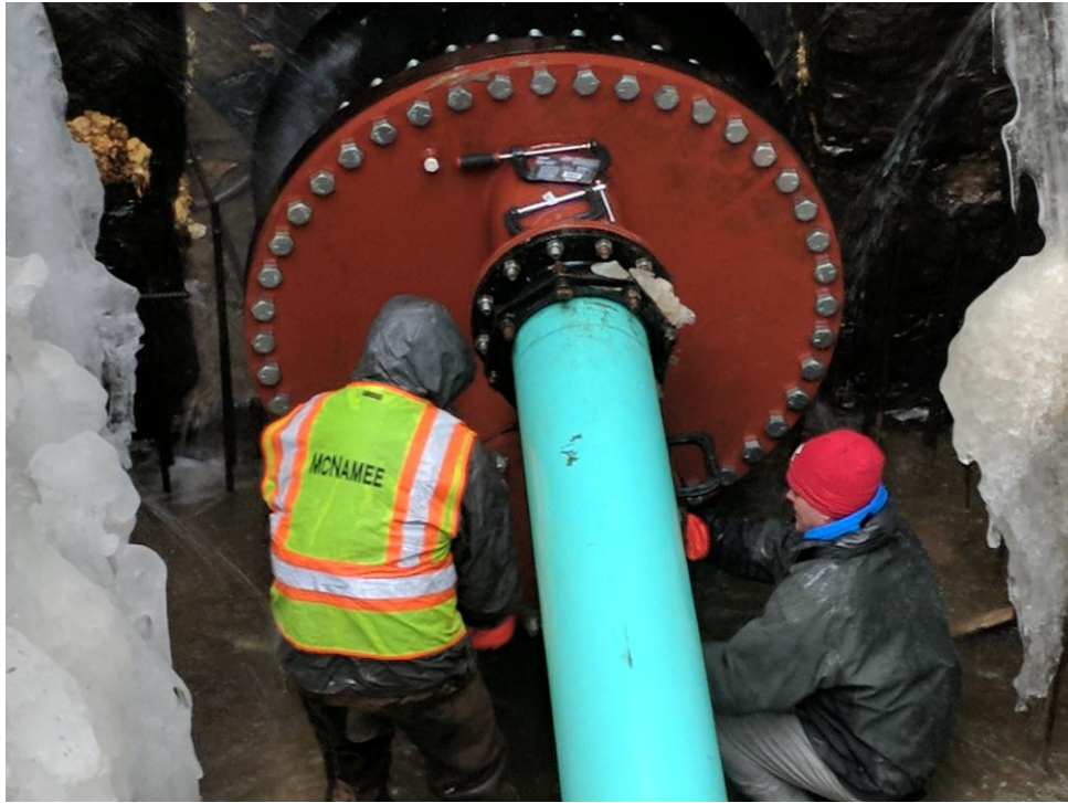
LLO pipe bulkhead with 12" dia. pipe connected and flowing full. Contractor working to open 18" dia. outlet.