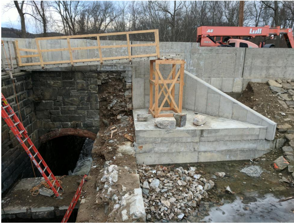
Completed construction of forebay structure for primary spillway and the integral segment of the parapet wall.